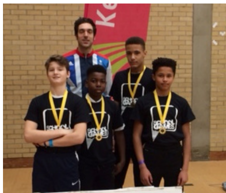
Greenacre Academy Yr 7 Rowing Champions