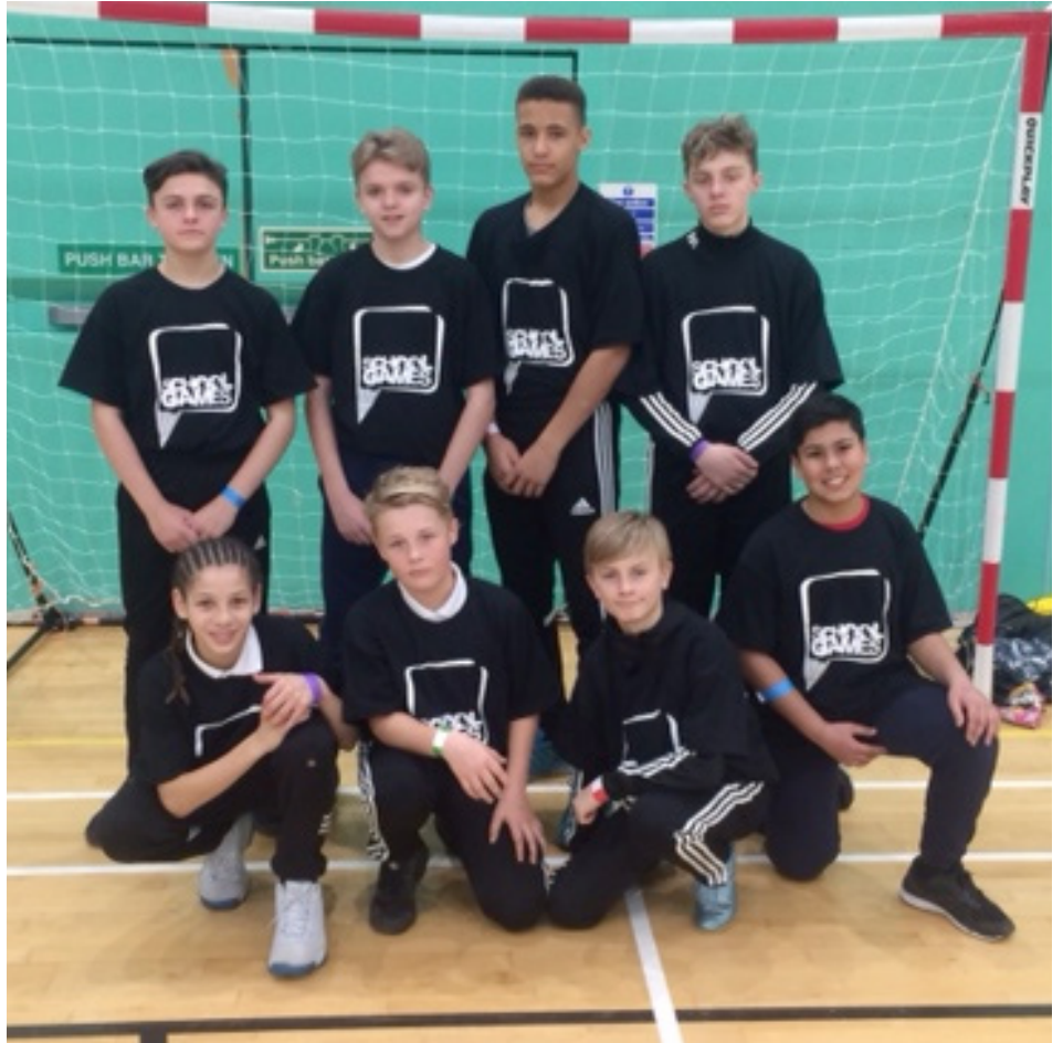
Handball Champions: Greenacre Academy U13's

A big congratulations to all the Greenacre Sports Partnership schools who represented Medway at the Kent School Games. Especially to Greenacre Academy who qualified through to the South East Handball Competition in May and will also be attending the National Rowing Competition in March.