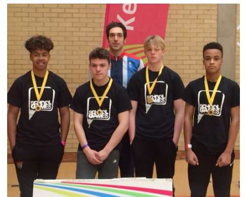
Greenacre Academy Yr 9 Rowing Champions