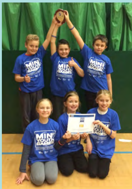
Mini Youth Games Badminton