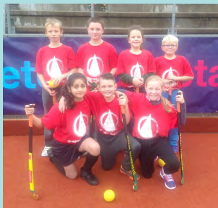
Mini Youth Games Hockey